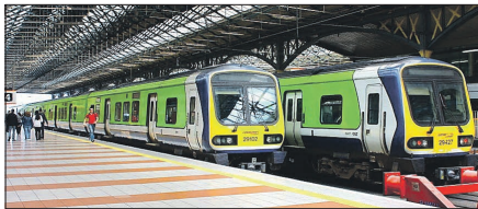
DART+ West, is set to treble capacity of the rail system from Maynooth/M3 Parkway to Dublin city centre.

It is art of a major plan for new electrified Dart services to Drogheda on the Northern line, to Celbridge on the Kil-